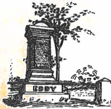
Town of Eddington - February 22, 1811